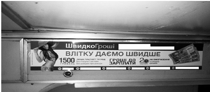
Image 2: Advertisement of a financial services company, ShvydkoHroshi, on Kyiv subways trains, August 2012

In 2011, the Ukrainian Marketing Association produced the Standards for Advertising Free from Gender Discrimination. 159 To ensure compliance with the Standards, the Industrial Gender Committee on Advertising was established to consider (either on its own initiative or following a complaint) sexist advertising. The statistics, however, suggest that the Committee is largely inf-